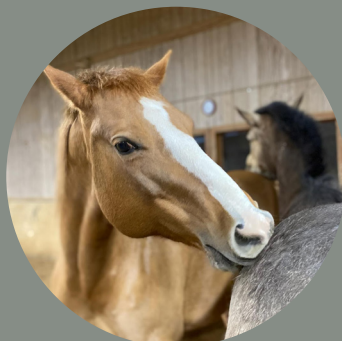
Winner Kierstin Cole's horse named Phoenix