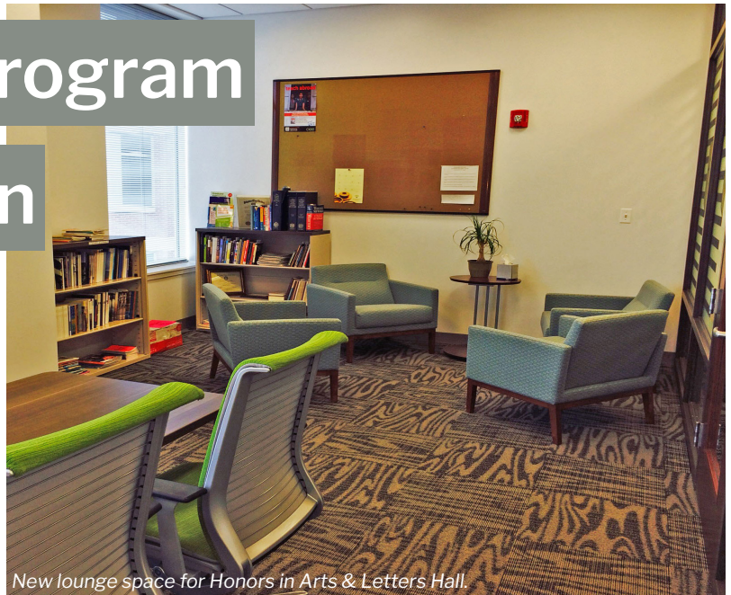
New lounge space for Honors in Arts & Letters Hall.

We have exciting news! In late summer, the Honors Program office moved out of the 990 West Fullerton building to spacious and beautiful new quarters on the second floor of Arts & Letters Hall. Besides new office space for Honors Program advisors and administration, there is a lounge area for students, and rooms for group projects and student meetings. We look forward to welcoming students to Arts & Letters when it is safe to be back on campus.