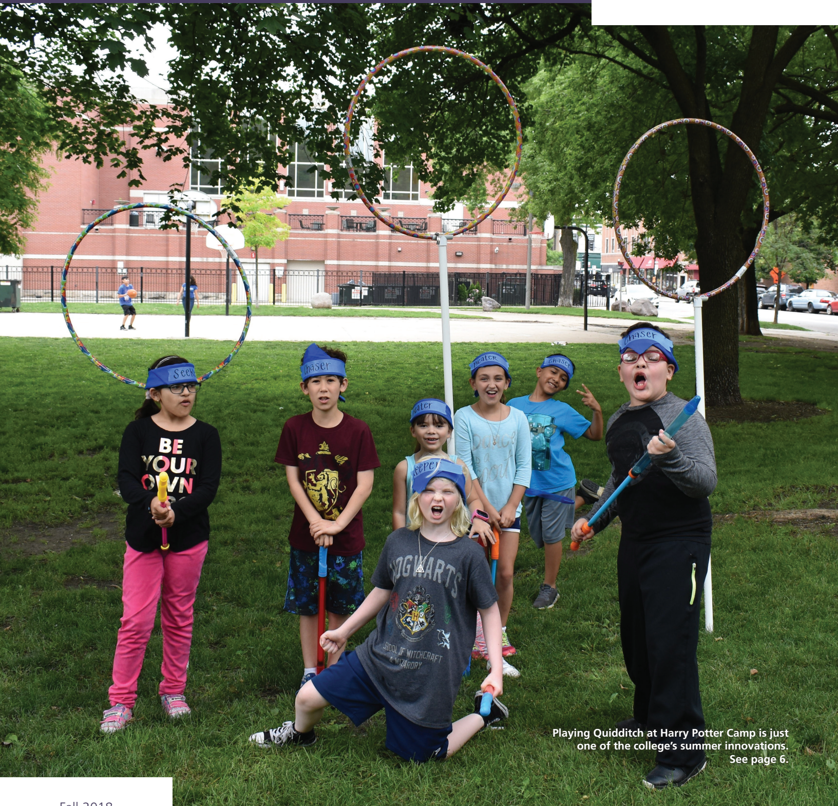
Playing Quidditch at Harry Potter Camp is just one of the college's summer innovations. See page 6.