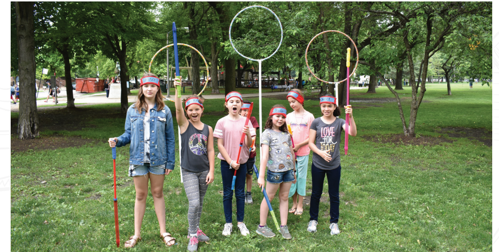
Students in COE's Harry Potter Camp played real-life games of Quidditch, a sport invented in the books.

"At our camps, children develop new friendships and gain new social skills, but it's a unique experience because they're at the university. Just being here expands their world and plants the seed that college is a possibility."