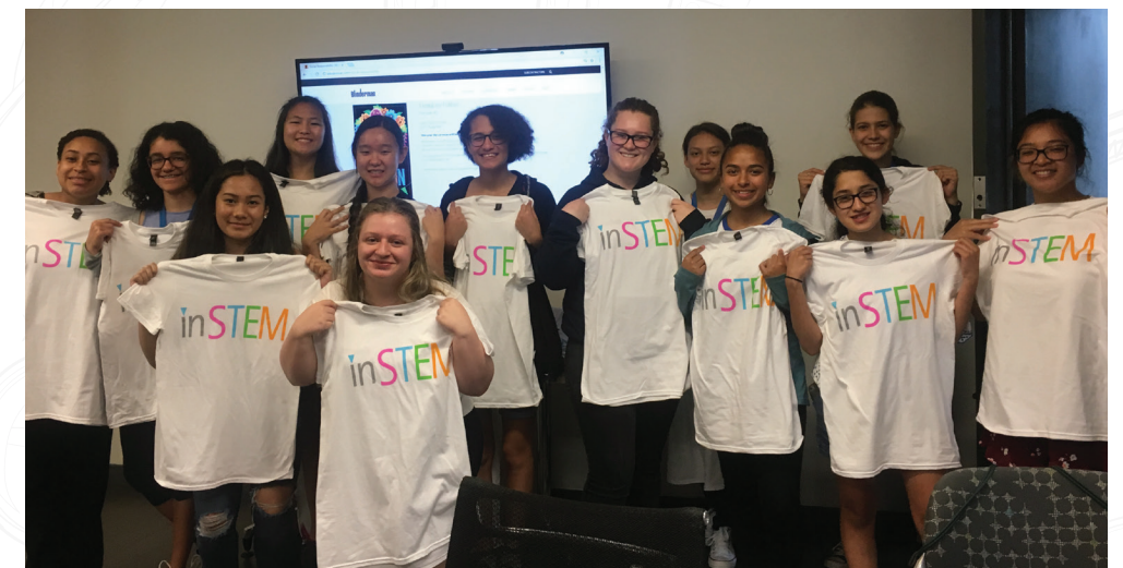
Previous InSTEM participants proudly returned to mentor new students in this year's camp.