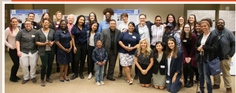
The higher education team proposed ways to support first-generation students.