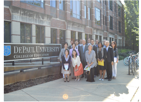
Above: SGI delegation with students and faculty in front of College of Education.