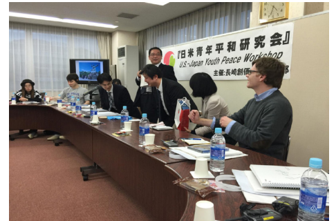
Above: Youth Exchange Dialogue in Nagasaki.