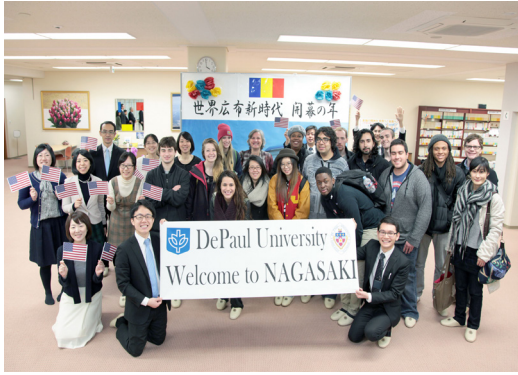
Above: DePaul students with Soka youth in Nagasaki.